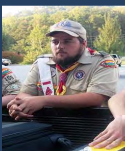
VICE CHIEF OF ADMINISTRATION