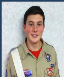
VICE CHIEF OF COMMUNICATIONS