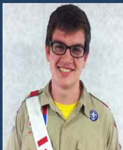
VICE CHIEF OF AMERICAN INDIAN ACTIVITIES